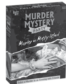
Murder on Misty Island