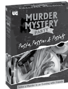
Pasta, Passion & Pistols