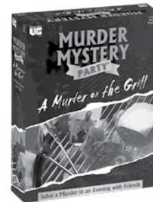
A Murder on the Grill