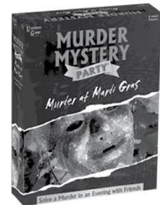
Murder at Mardi Gras