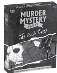
The Icicle Twist