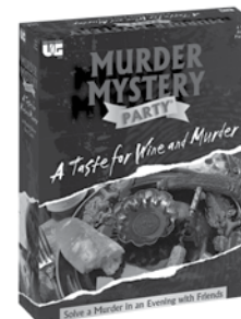
A Taste for Wine and Murder