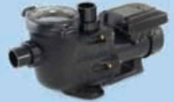
Also available in model that connects directly with Hayward® controls (SP3200VSPND).